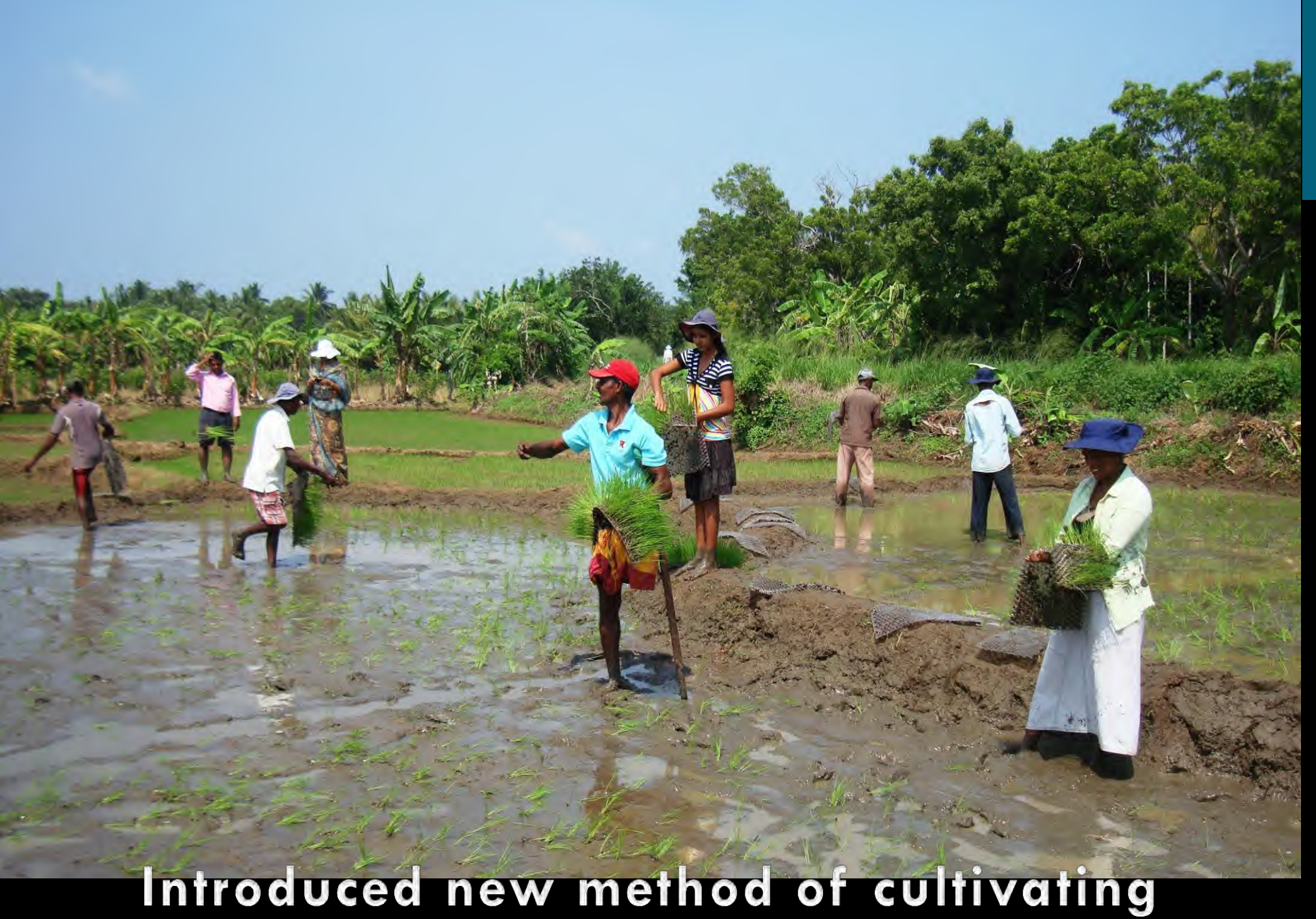
paddy – Parachute Method